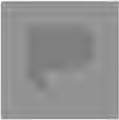
Alyzza C. Ozer